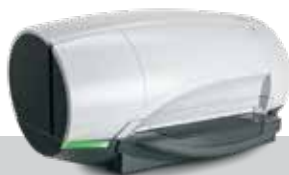
Vita Flex CR System