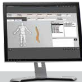
Image Suite V4 Software