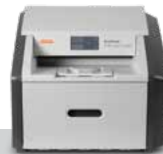
DRYVIEW 5700 Laser Imager